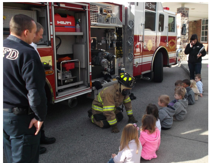
The 2's learning about fire safety from the WFFD!